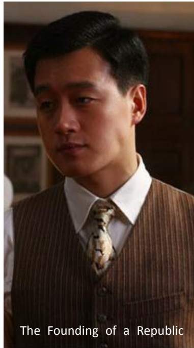
The Founding of a Republic