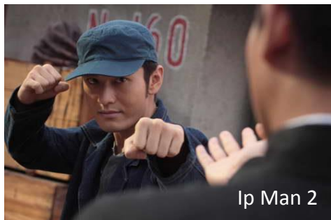
Ip Man 2